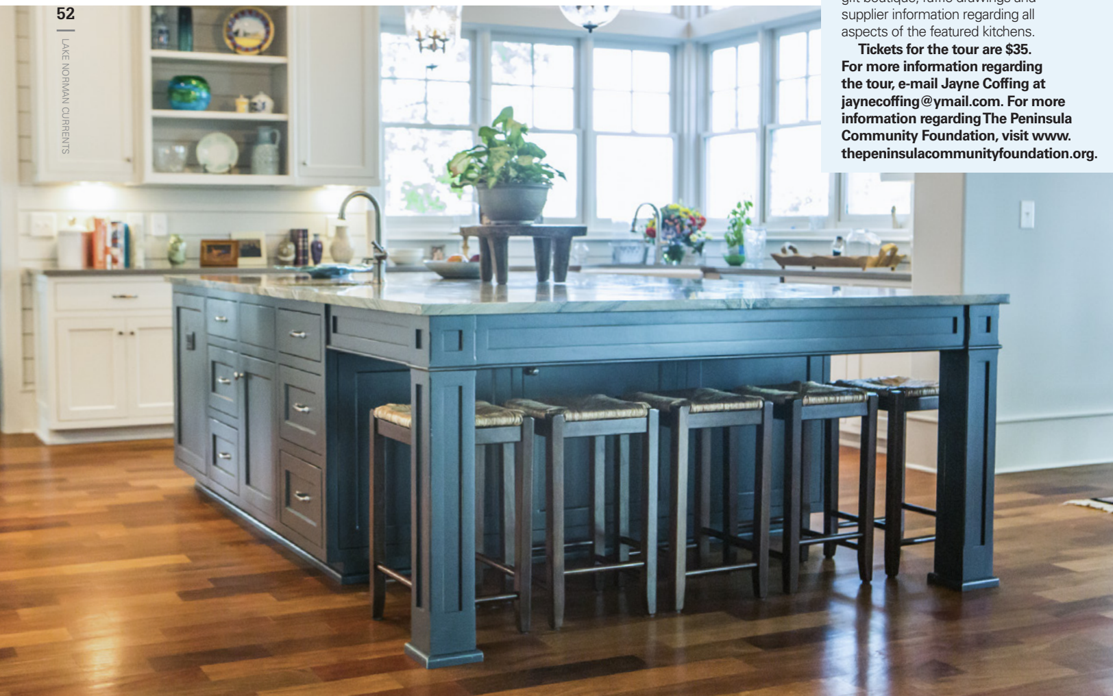
Below , a large island makes entertaining family and friends easy