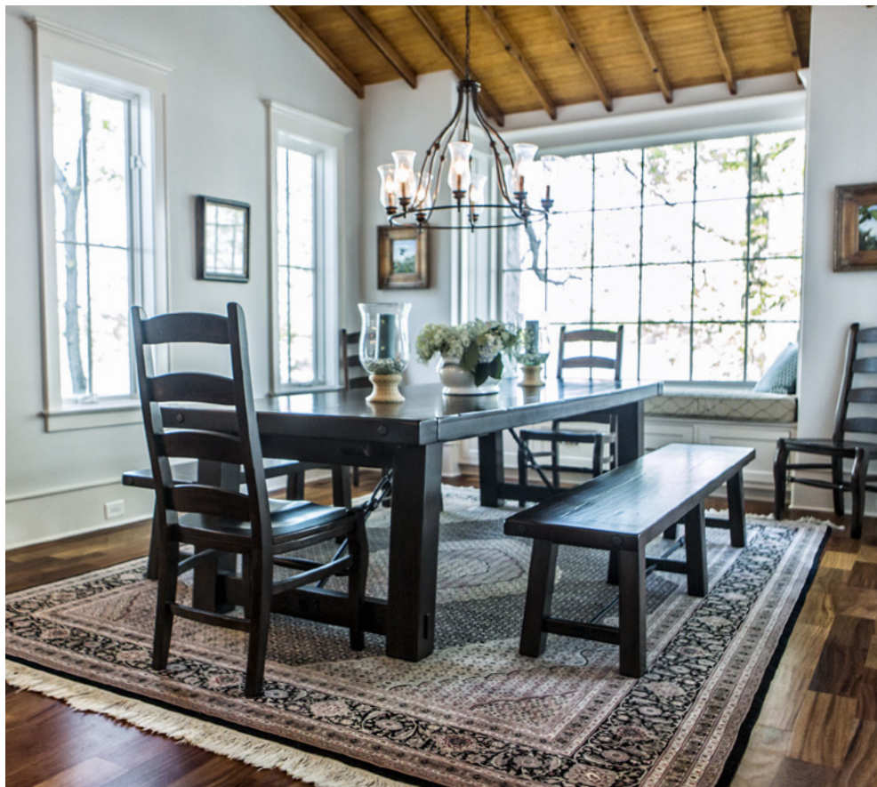
Left , the casual dining area features a window seat overlooking the lake.