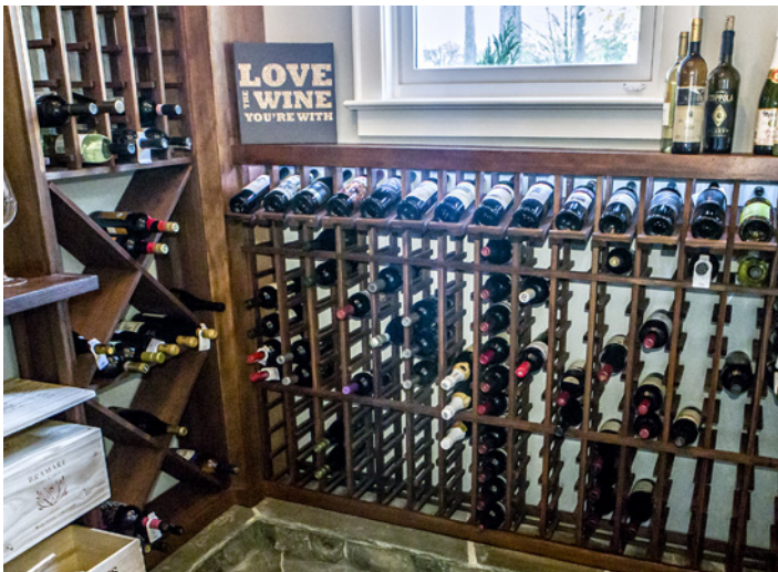
With the capacity for 900 bottles, the wine cellar is located underneath the staircase near the kitchen.