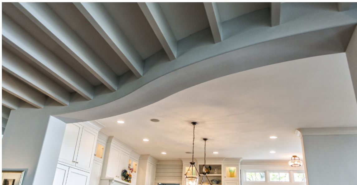
The ceiling detail further adds to the Cape Cod feel of the home.

and Grainda Builders, the Engels were able to encapsulate the laid-back coastal feeling of Cape Cod in their home, which is featured in The Nosy Neighbor Kitchen Tour on May 14.