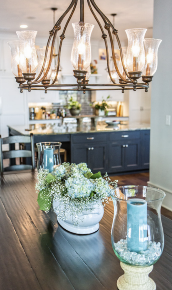
A farm table from Pottery Barn welcomes guests with ease.